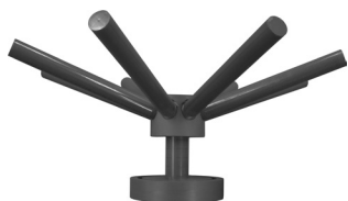
Z-style distributor shown mounted on blind flange.