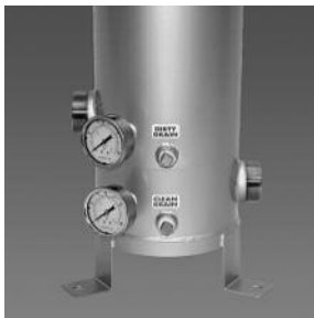
Gauge port assembly with mounting legs