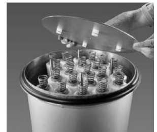
Adjustable top plate accepts variable length cartridges

Gasket: Buna, EPR, Silicone, Viton, or Teflon Encapsulated Silicone