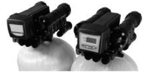
Magnum IT 764 Twin Alternating