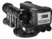
Magnum IT 762 Softener Valve