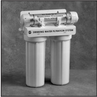
□ Series 200-UV