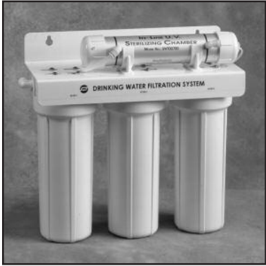
□ Series 300-UV