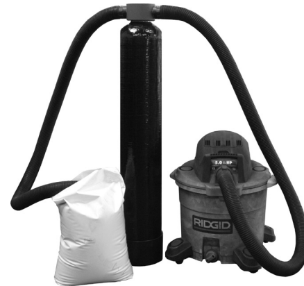
(ABOVE) TYPICAL ASSEMBLY.

NOTE: Inlet hose should never be left unattended while vacuum is in operation.